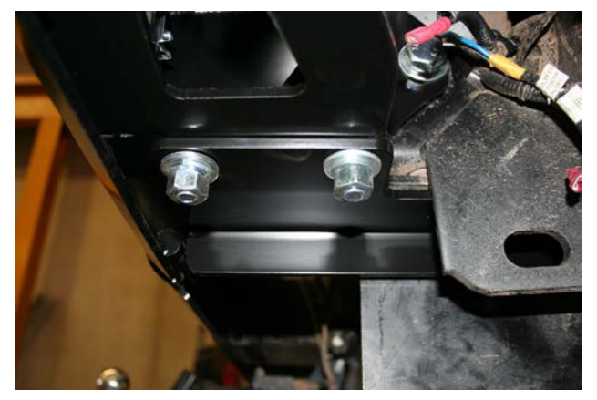
Fig. 10 (showing right side)