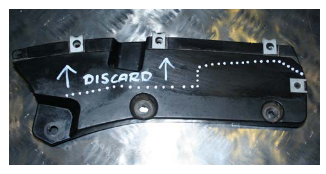
Fig. 11 (showing right side)

15. If carriers or jerry can holders are to be fitted please see the separate instructions enclosed.