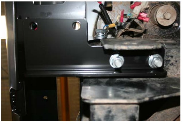
Fig. 9 (showing right side)

Use the M6 pan head screws and M6 wizz nuts.